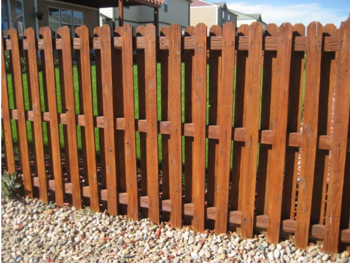
Alternating Wood Pickets (Shadowbox)