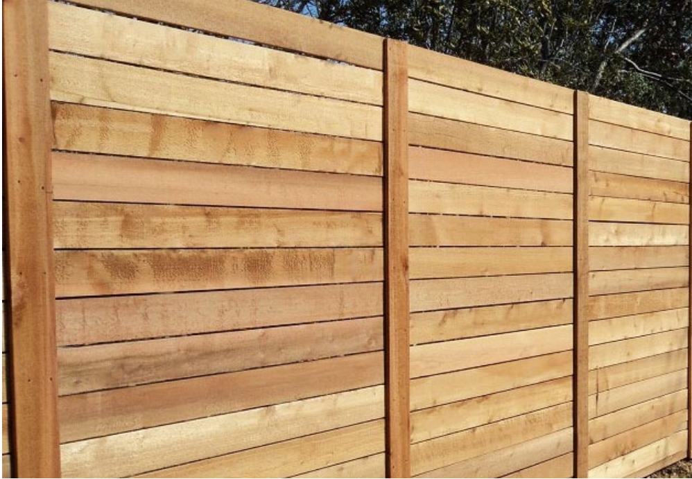
Horizontal wood fence