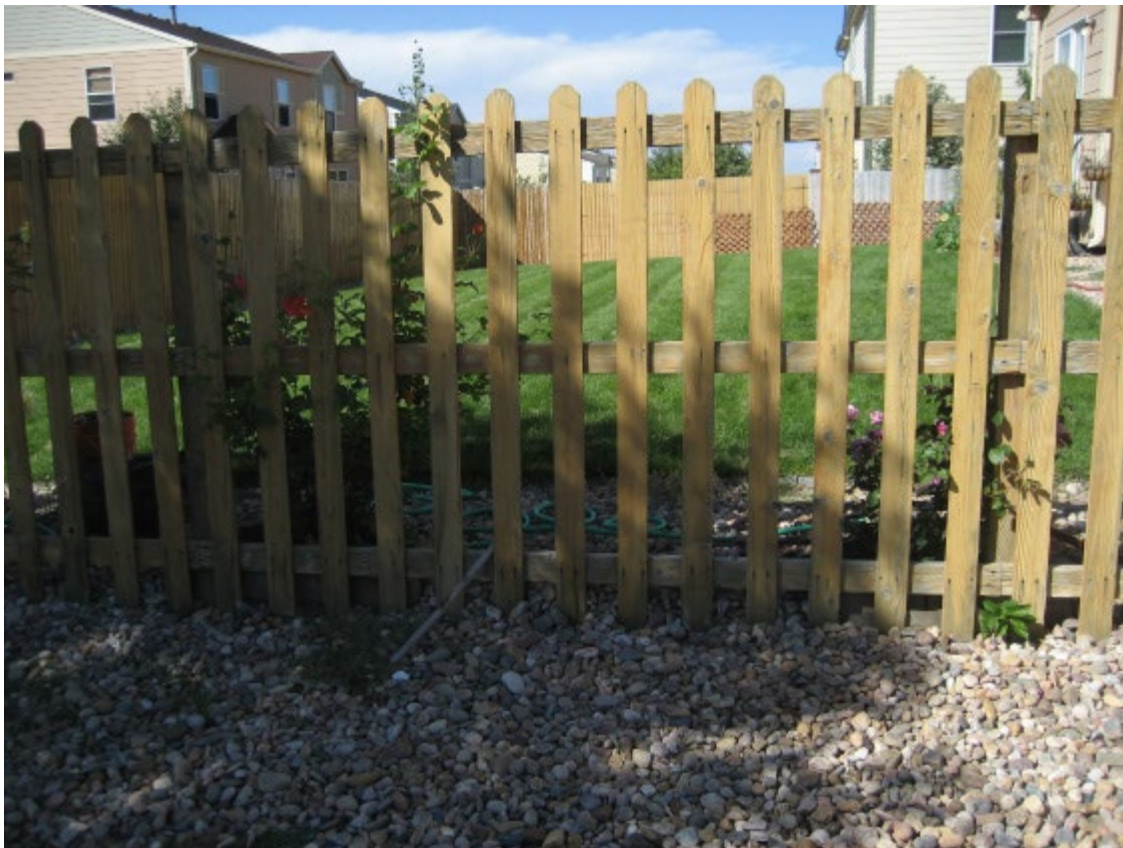
Separated Wood Pickets